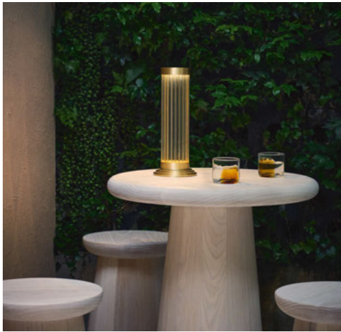
Porto J. Adams & Co.

British lighting manufacturer J. Adams & Co. presents Porto, its first portable LED table light. Building on the visual language of its Flume collection, Porto marks a new direction, combining its precision engineering with the latest in portable LED technology. With a design that maximises on flexibility, the light can be easily picked up and moved to change the ambience of any space. Featuring a completely wireless touch-sensitive light source, dimming capabilities, and a battery life of seven hours, the Porto table light is both fun and intuitive to use.